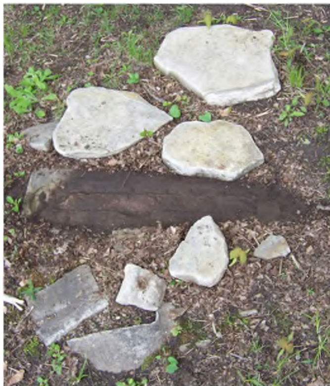
Current arrangement of pieces, with socket and broken cement repair