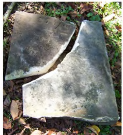
Stone broken (2014)