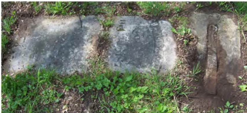
Arrangement of pieces and socket (2013)