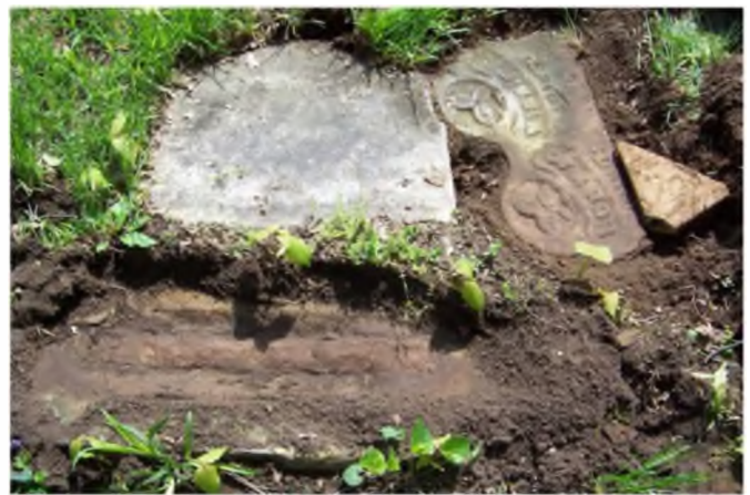
With socket exposed