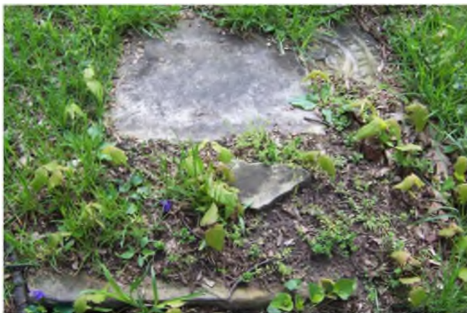
Current arrangement of pieces