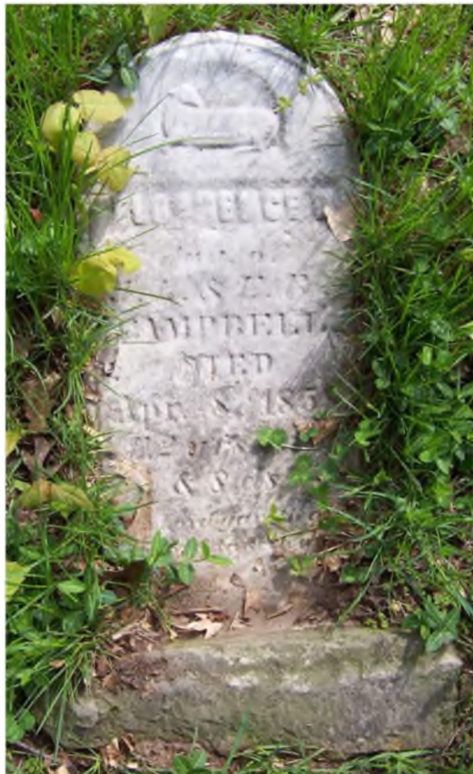
Current position of stone