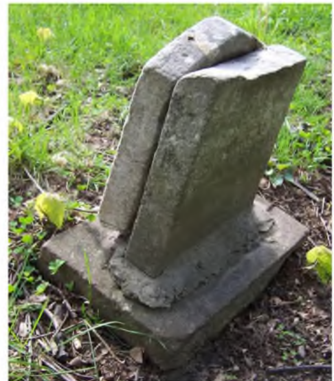
Current arrangement of pieces

Lat / Long: 42° 25' 44.45" N , 83° 29' 12.13" W