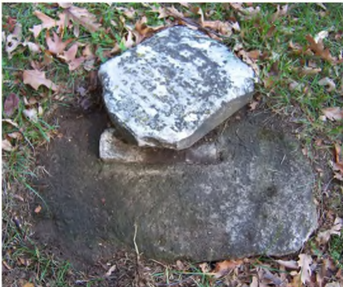
Current placement of marker.

Lat / Long: 42° 25' 44.43" N , 83° 29' 11.90" W