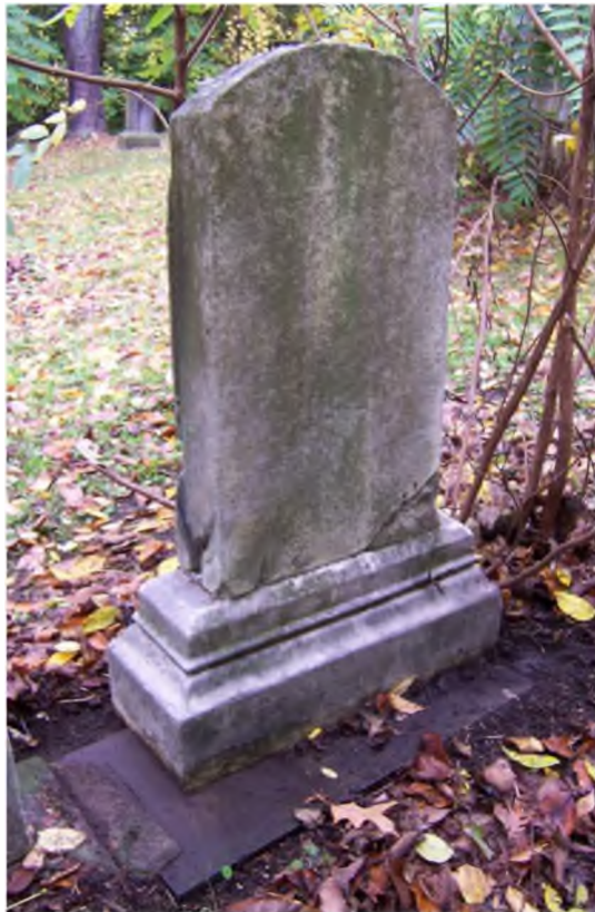
rear view of Marker 335