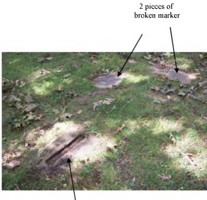
2 pieces of broken marker