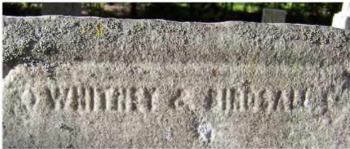
Stonecutter's Mark: Whitney & Birdsall