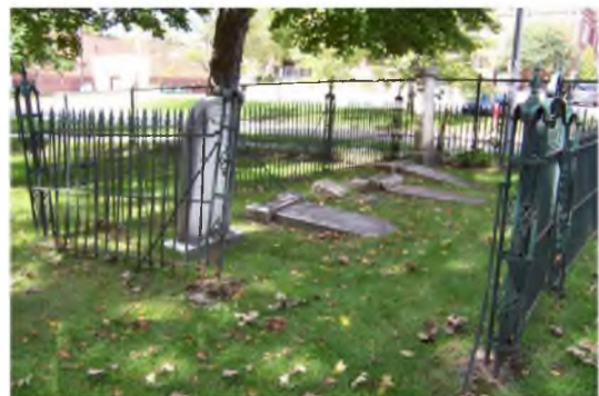
Northrop-Stevens family plot

Lat / Long: 42° 25' 47.05" N , 83° 29' 11.78" W