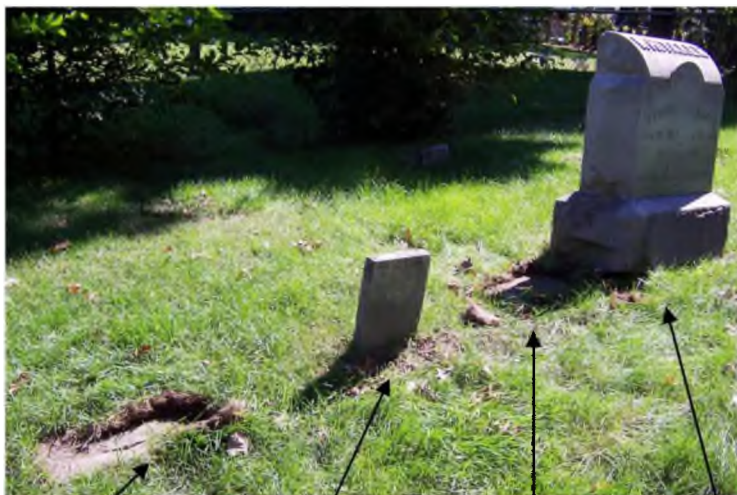
Socket of Marker 271