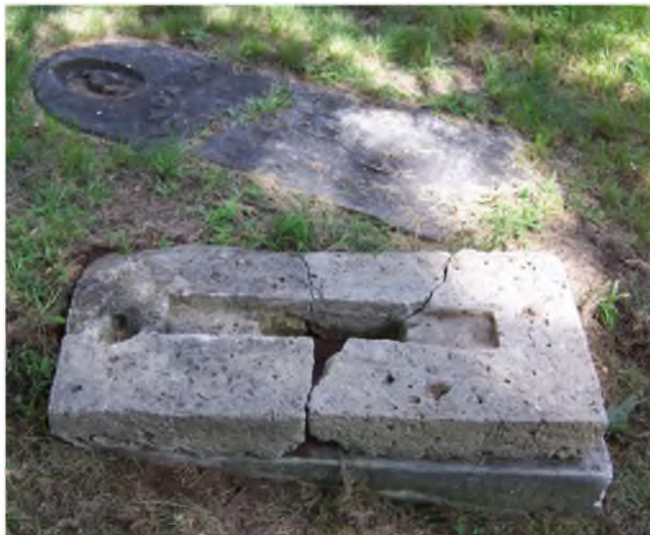
Broken cement socket on top of a sandstone base