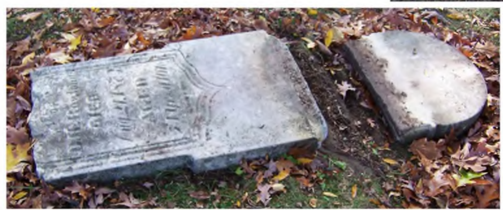
October 2014: This marker has now fallen over.

Lat / Long: 42^\circ~25'~46.01"~N , ~83^\circ~29'~11.32"~W