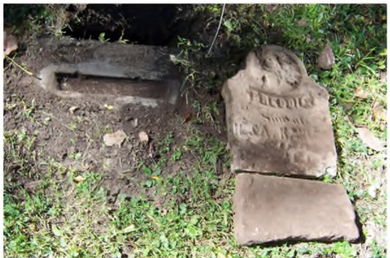
Entire stone and socket exposed

Lat / Long: 42° 25' 46.48" N , 83° 29' 12.72" W