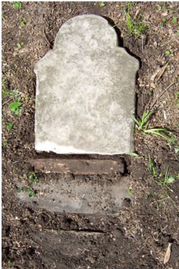
Current arrangement of pieces, with socket