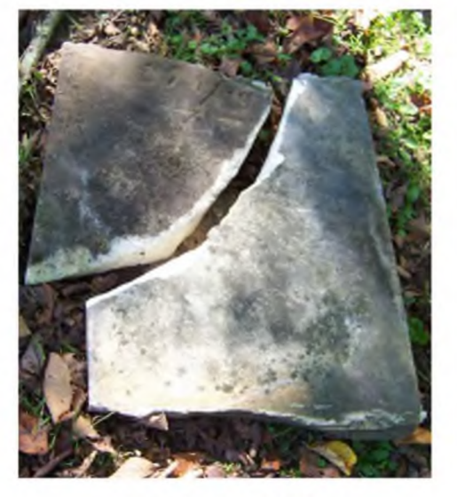
Stone broken (2014)