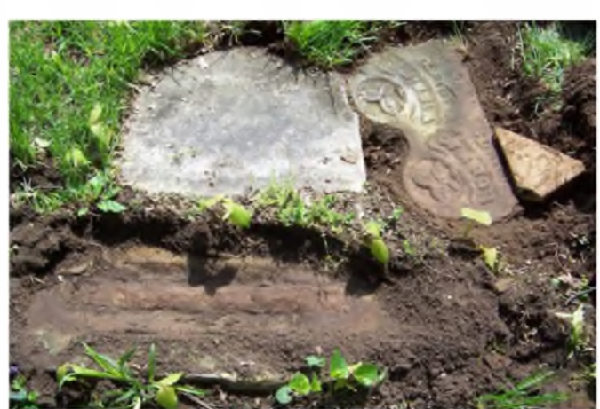
With socket exposed