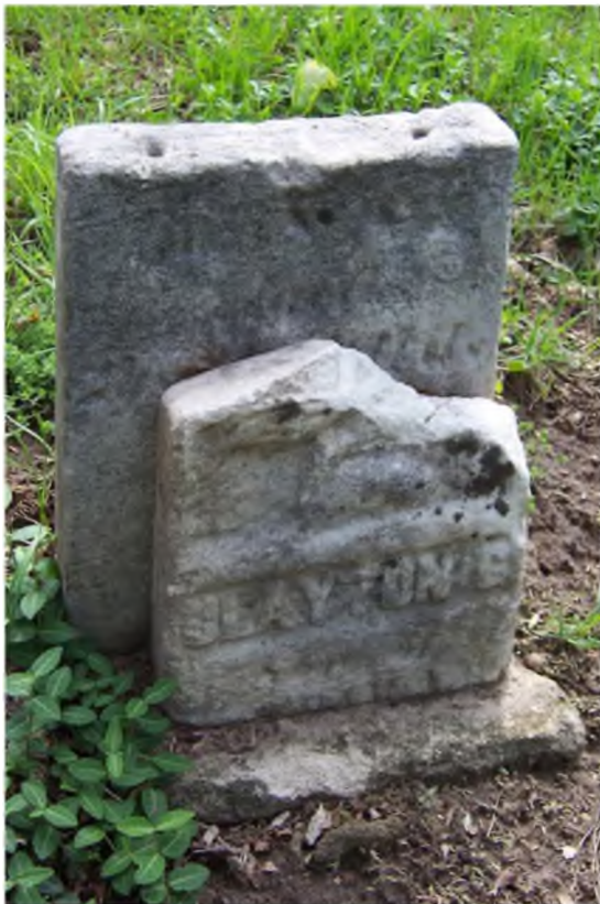
Current arrangement of pieces

Lat / Long: 42° 25' 44.34" N , 83° 29' 12.14" W