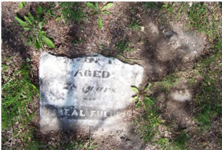
Current arrangement of pieces, with socket buried underneath