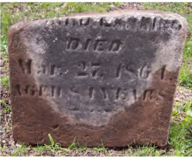
Lat / Long: 42^{\circ}\ 25'\ 45.73"\ N , \ 83^{\circ}\ 29'\ 11.70"\ W