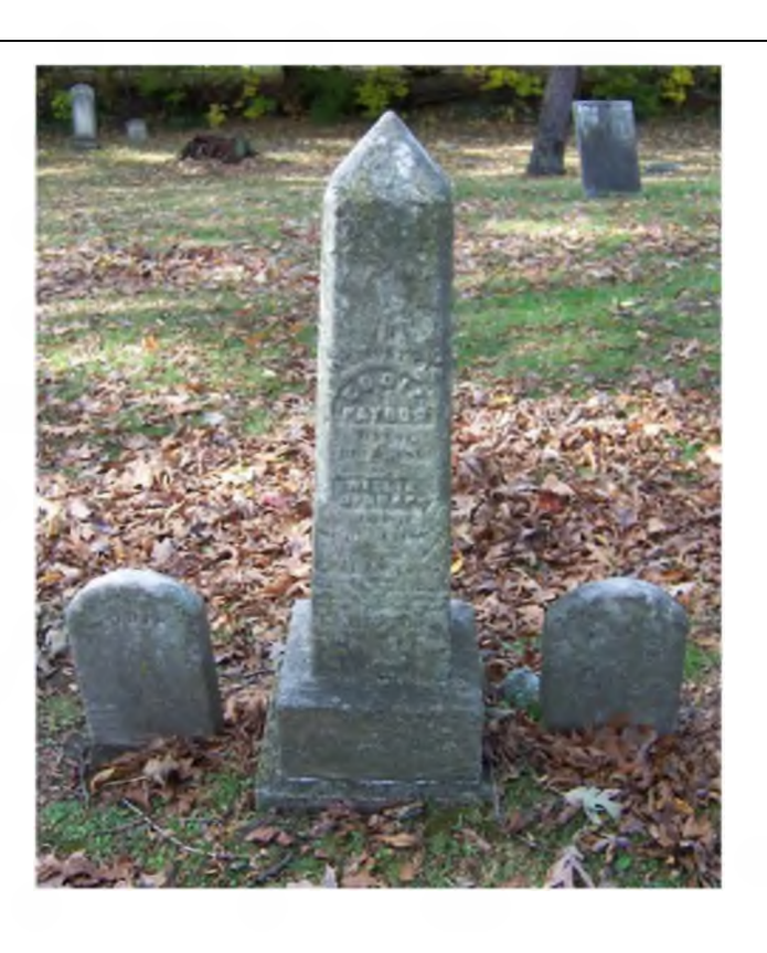
Lat / Long: 42^{\circ} 25' 46.36'' N , 83^{\circ} 29' 11.81'' W