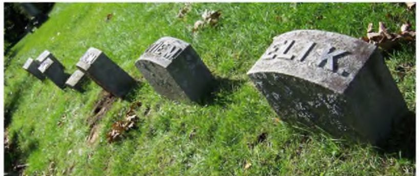
Simonds and Horton Family Plot

Lat / Long: 42° 25' 45.36" N , 83° 29' 9.26" W