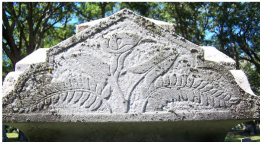
The calla lily and fern frond motif decorates the top of all four sides of this monument.