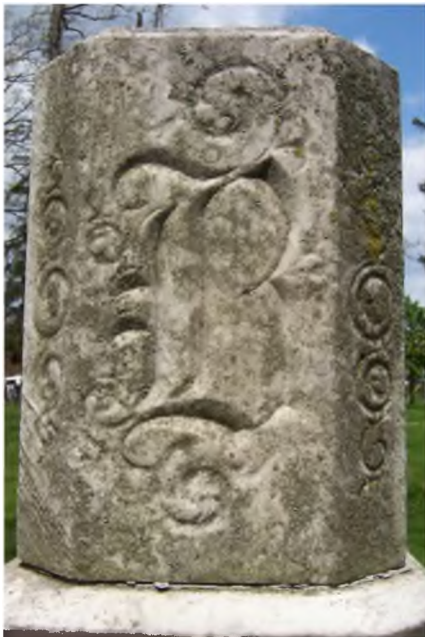
Currently facing south