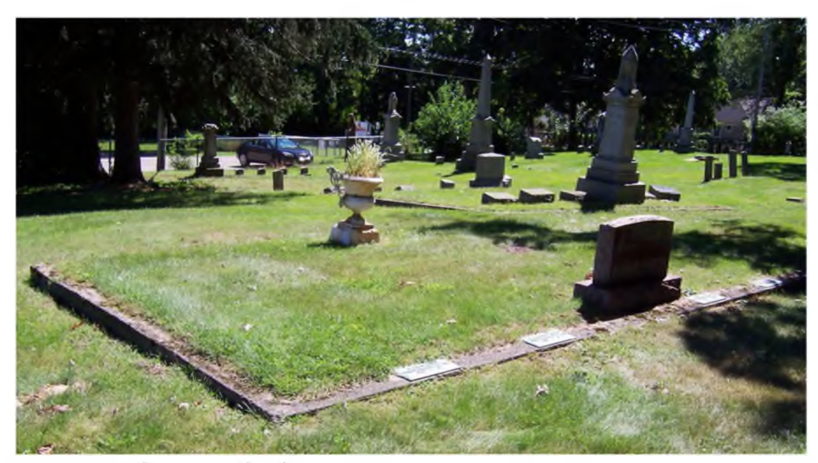
The Lewis Family Plot is outlined in cement. The north edge of the plot (on the left side in this photo) measures 176" (or 14 feet 8 inches). The east edge measures 246" (or 20 feet 6 inches). The bronze plaques are mounted to this cement edging on the west side of the family plot.